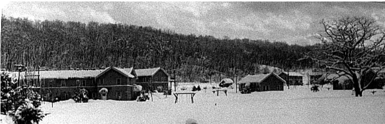
Family Housing Area

Camp Crawford had brick single-story platoon barracks for about 4500 troops, officer and NCO clubs, a large Service club for junior enlisted men, a field house (gym), chapel, theater, PX, commissary, quartermaster laundry, quartermaster bakery, steam plant, bowling lanes, and a large family housing area with an all-grades school. The Army hospital was in downtown Sapporo. Mount Eniwa, an extinct volcano, loomed over the post and the adjacent village of Makomanai. To the north and west were miles of steep, forested hills inhabited by more black bears than people. Because Hokkaido was sparsely populated, training land was more plentiful than on Japan's other islands. The most popular bivouac site for field maneuvers was a scenic mountain meadow overlooking Sapporo, Hokkaido's largest city. The site was used by Japanese farmers for grazing sheep and therefore had its unpleasant side as well. Eighteen miles deeper in the mountains was Shimamatsu Training Area, near the village of Eniwa. Firing ranges for heavy weapons were 25 miles away at Chitose. Japan's raid on Pearl Harbor was planned at Building 5 on Chitose airfield.